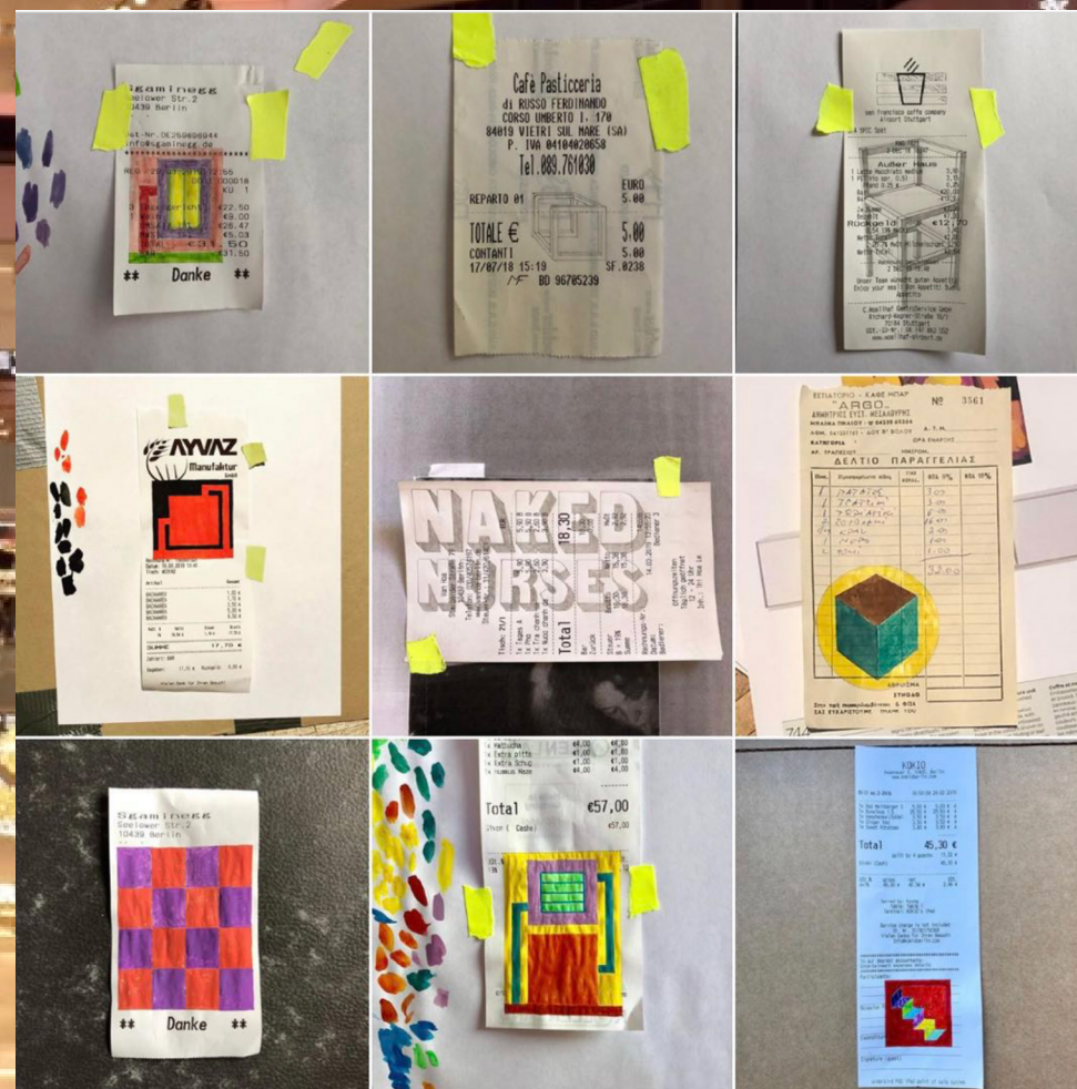
* Conceptual visual outcomes of project works, sample images designed accordingly to previous artworks of Tango and Pak.